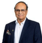
The Honourable Muhammad Yaseen Minister of Immigration and Multiculturalism

A handwritten signature in blue ink, appearing to read "Muhammad Yaseen", with a long horizontal flourish extending to the right.