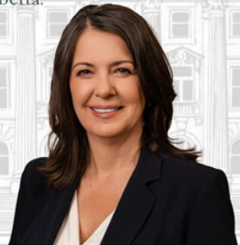
Honourable Danielle Smith, Premier of Alberta