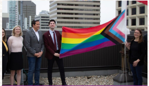
Equity in Action: Alberta LGBTQ+ Chamber of Commerce