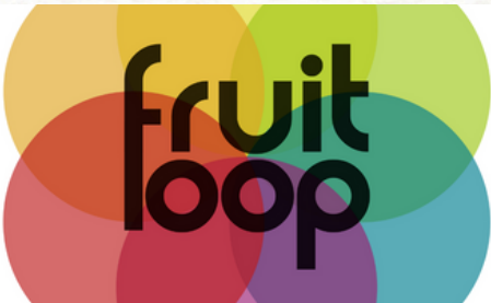
LGBTQ+ Equity: Fruit Loop Society of Alberta (Business Category)